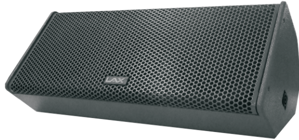
2×6.5" Two-Way Full Range Speaker